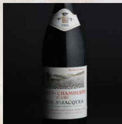
A bottle of Armand Rousseau's 1980 Gevrey-Chambertin Clos St. Jacques set a world record, realizing $3,705.