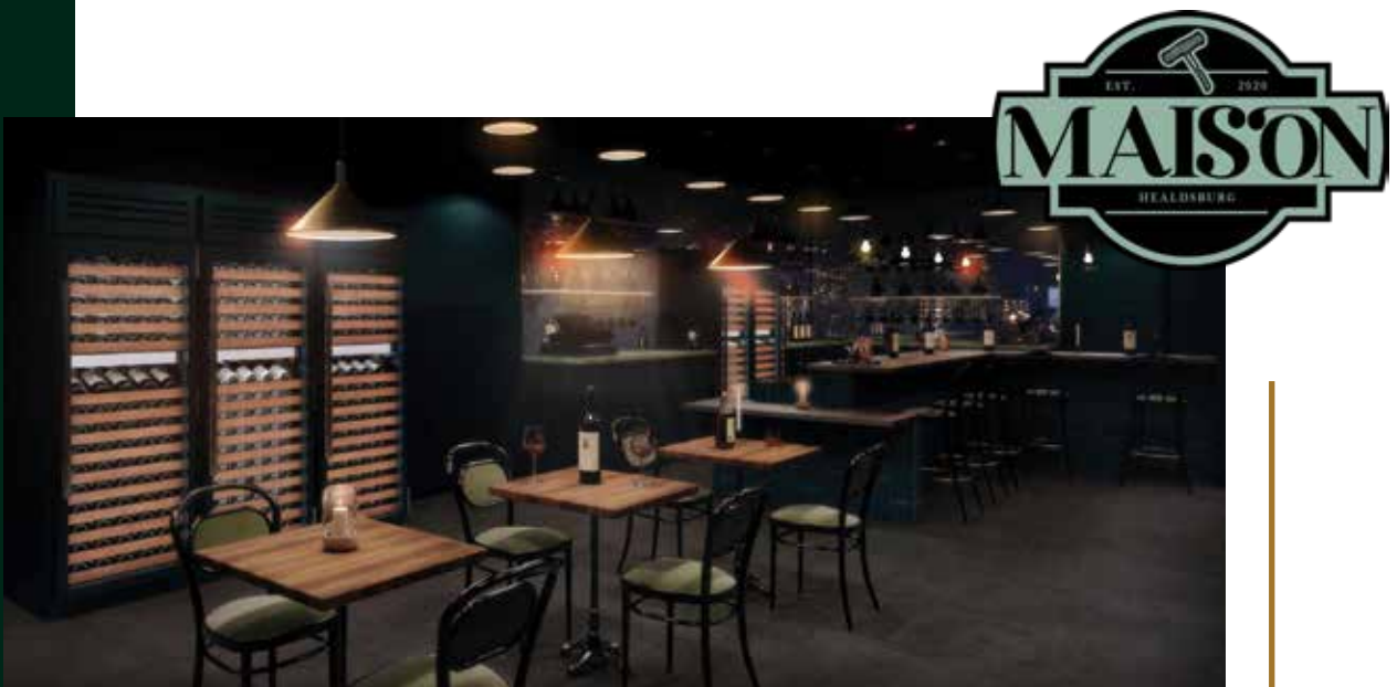
A Rendering of Maison Healdsburg