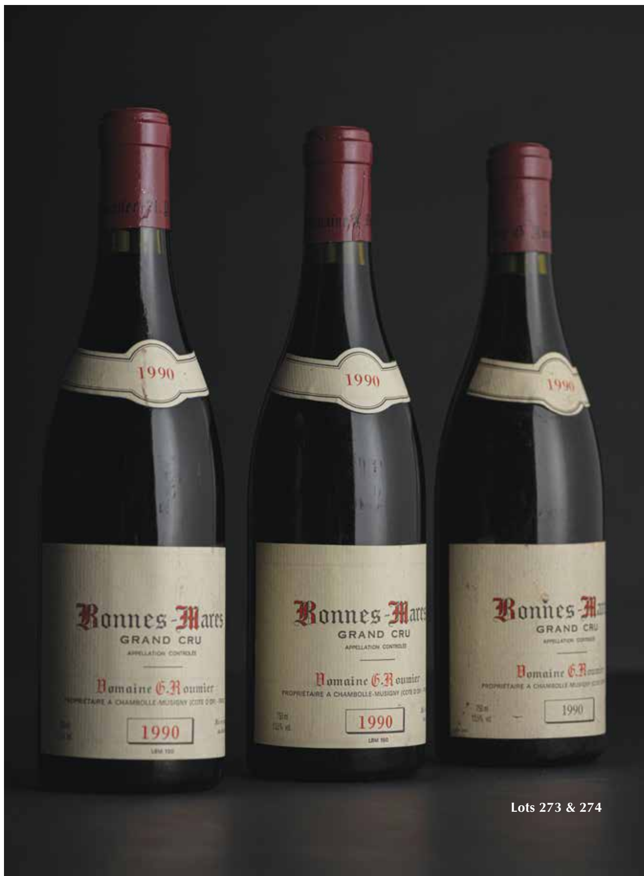
Lots 273 & 274