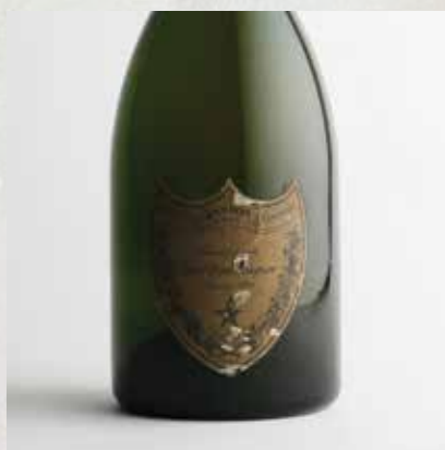
A magnum of 1966 Dom Pérignon P3 realized double its low estimate at $10,621, beating a previous auction high of $9,000.