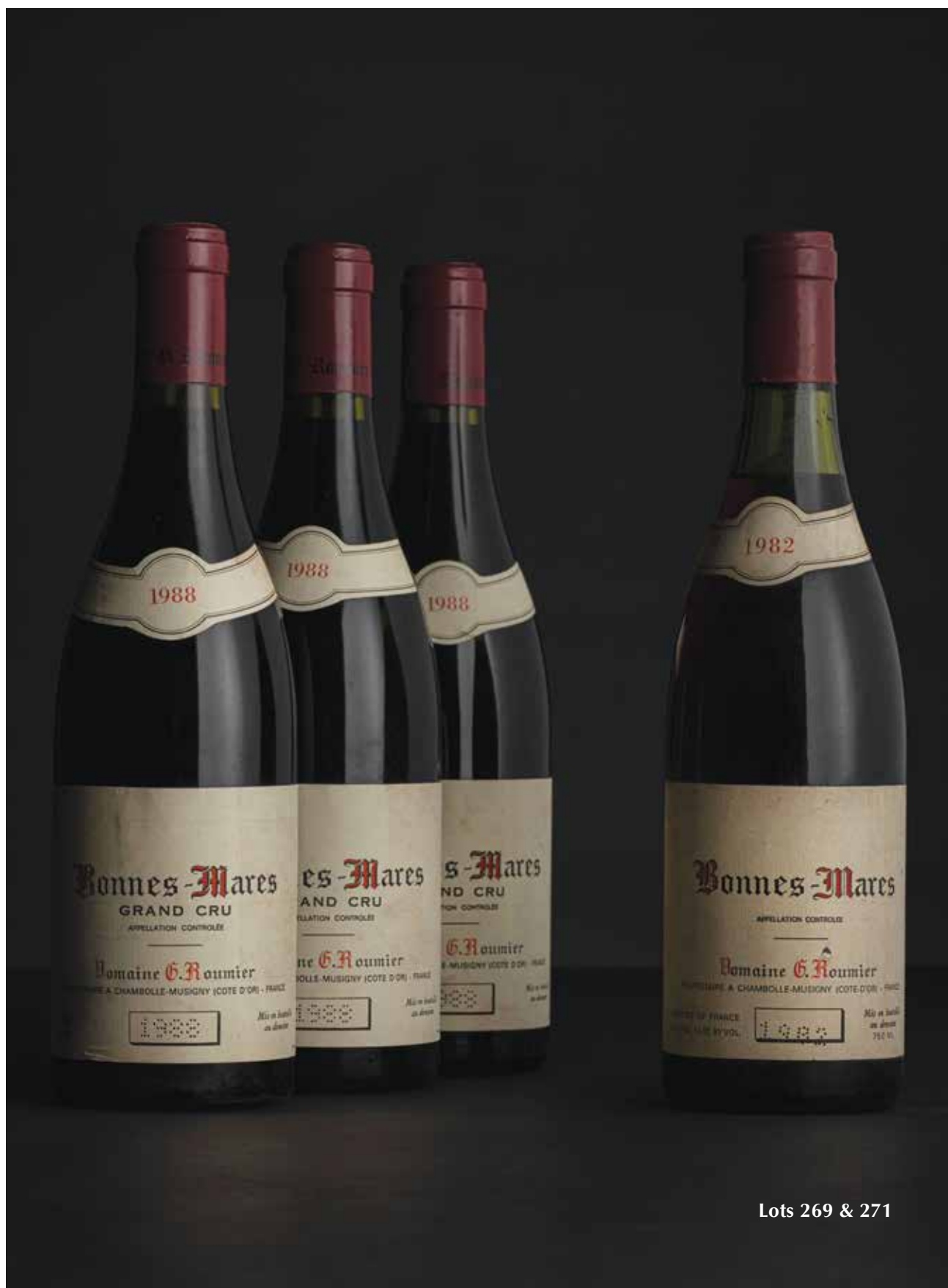
Lots 269 & 271