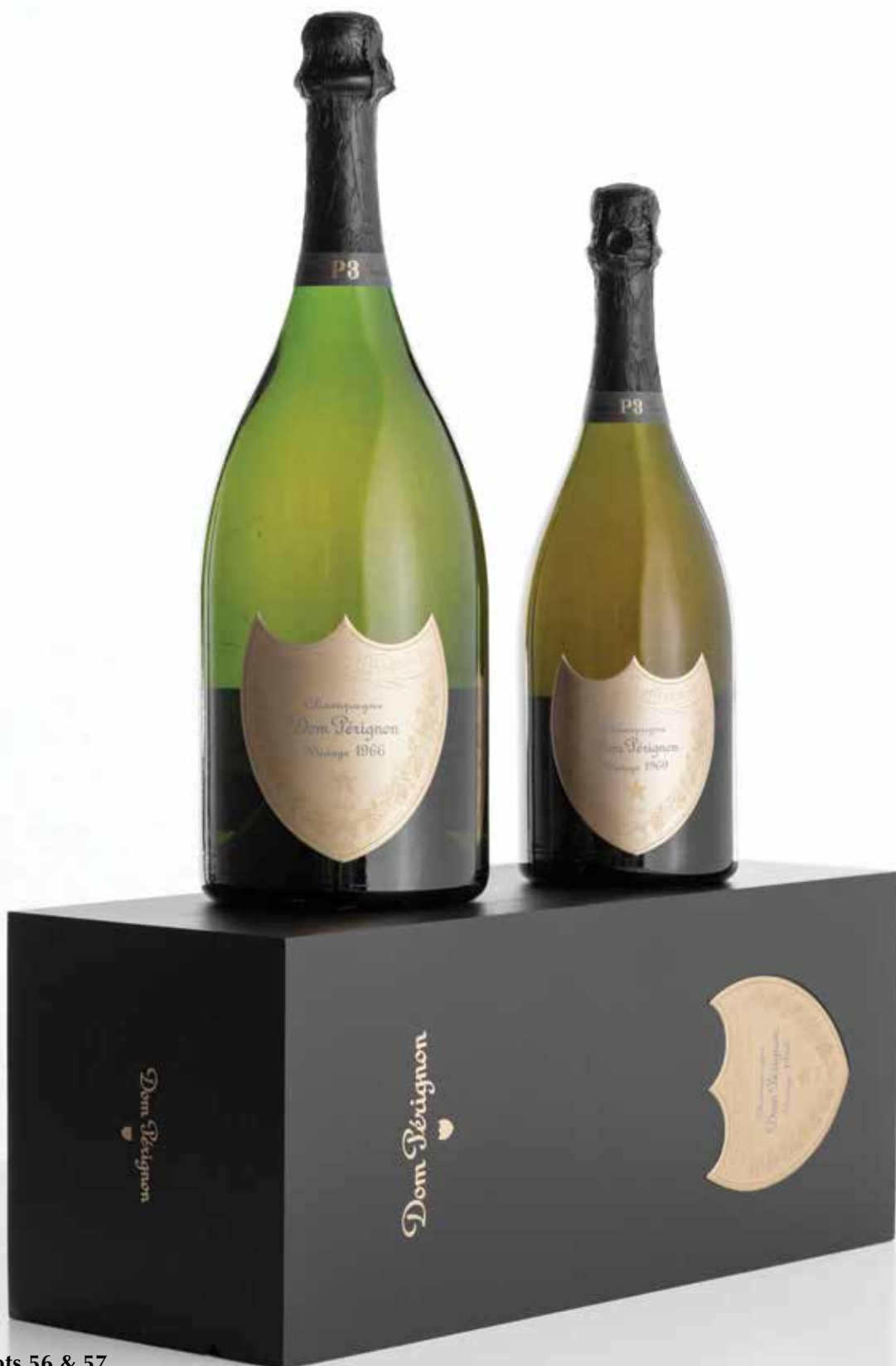
Lots 56 & 57