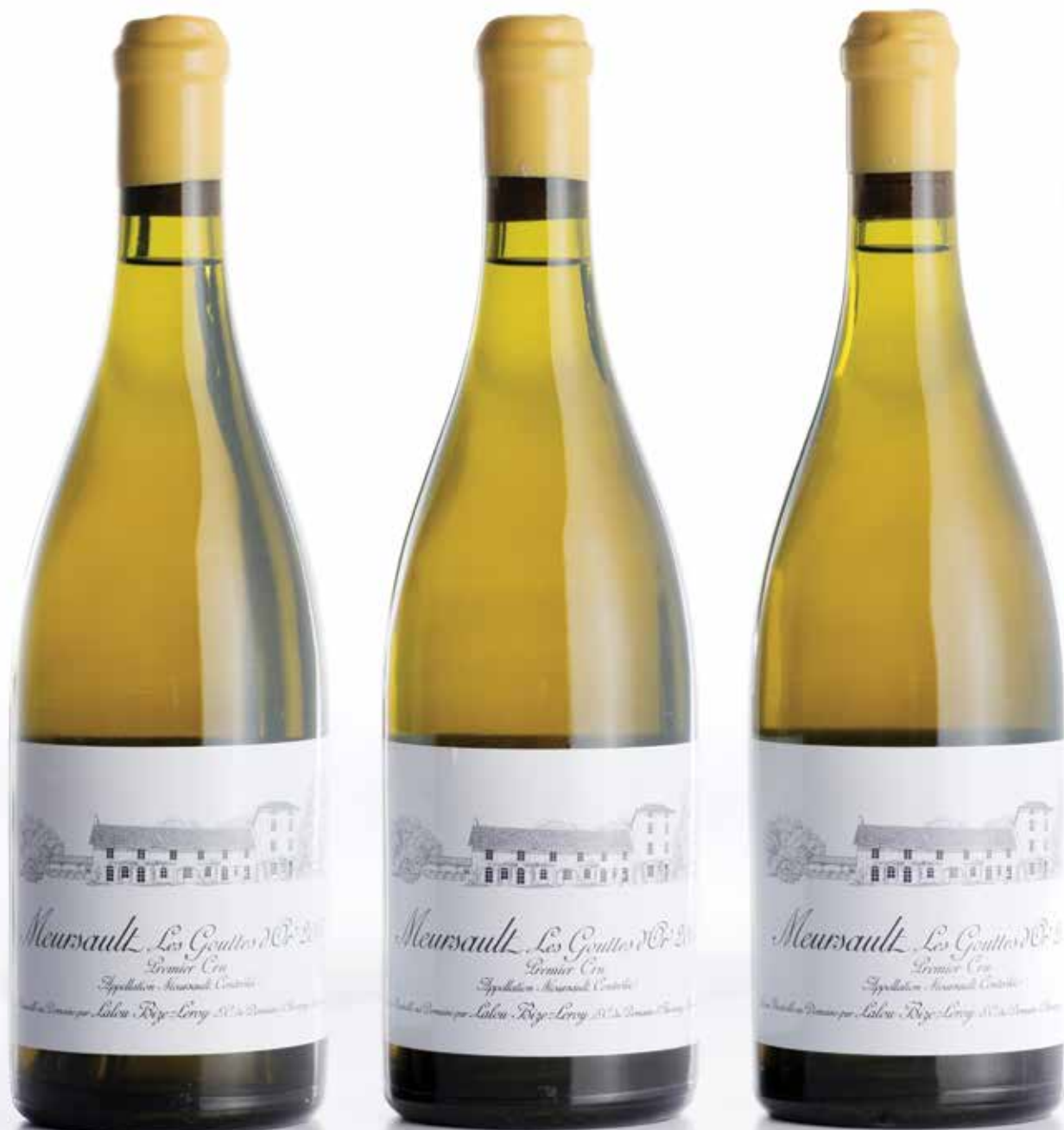
Lots 482 & 483