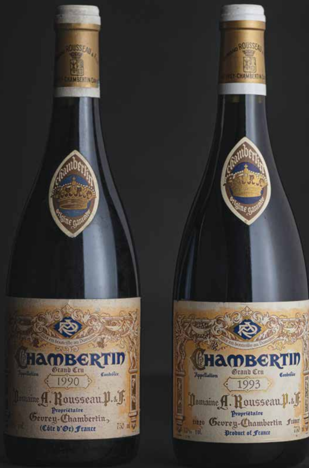
Lots 325 & 326