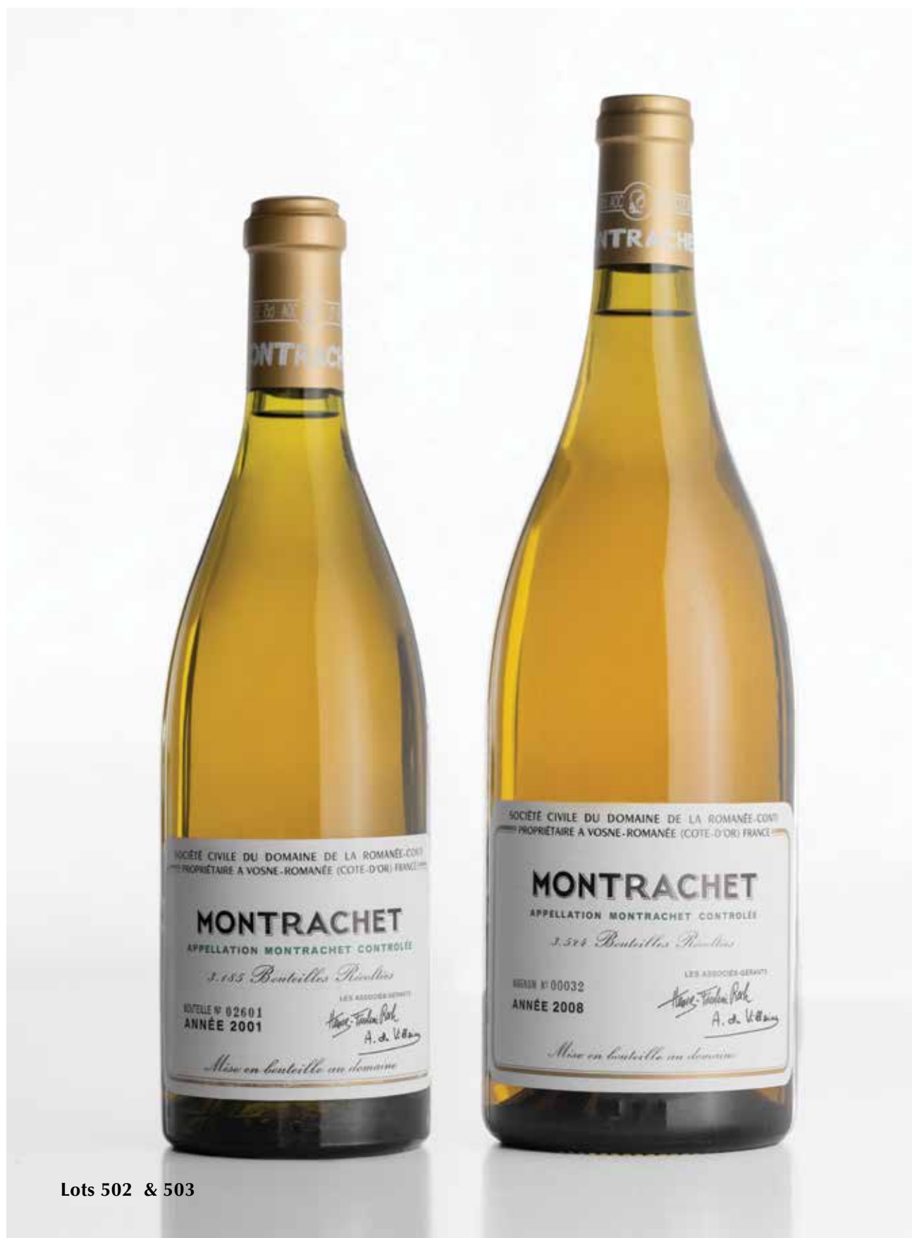
Lots 502 & 503