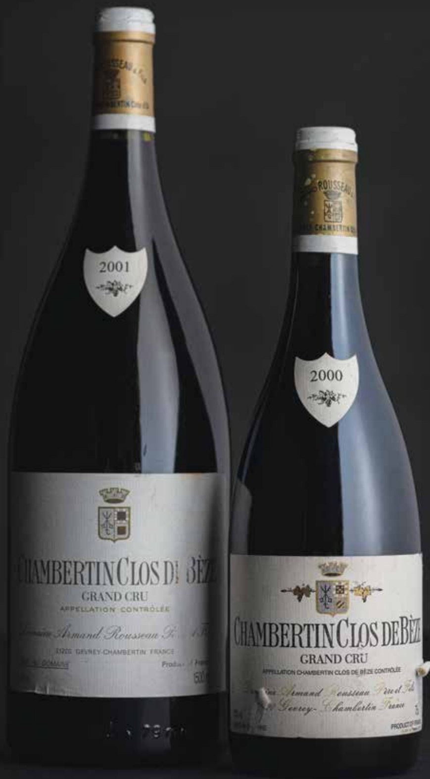
Lots 344 & 346