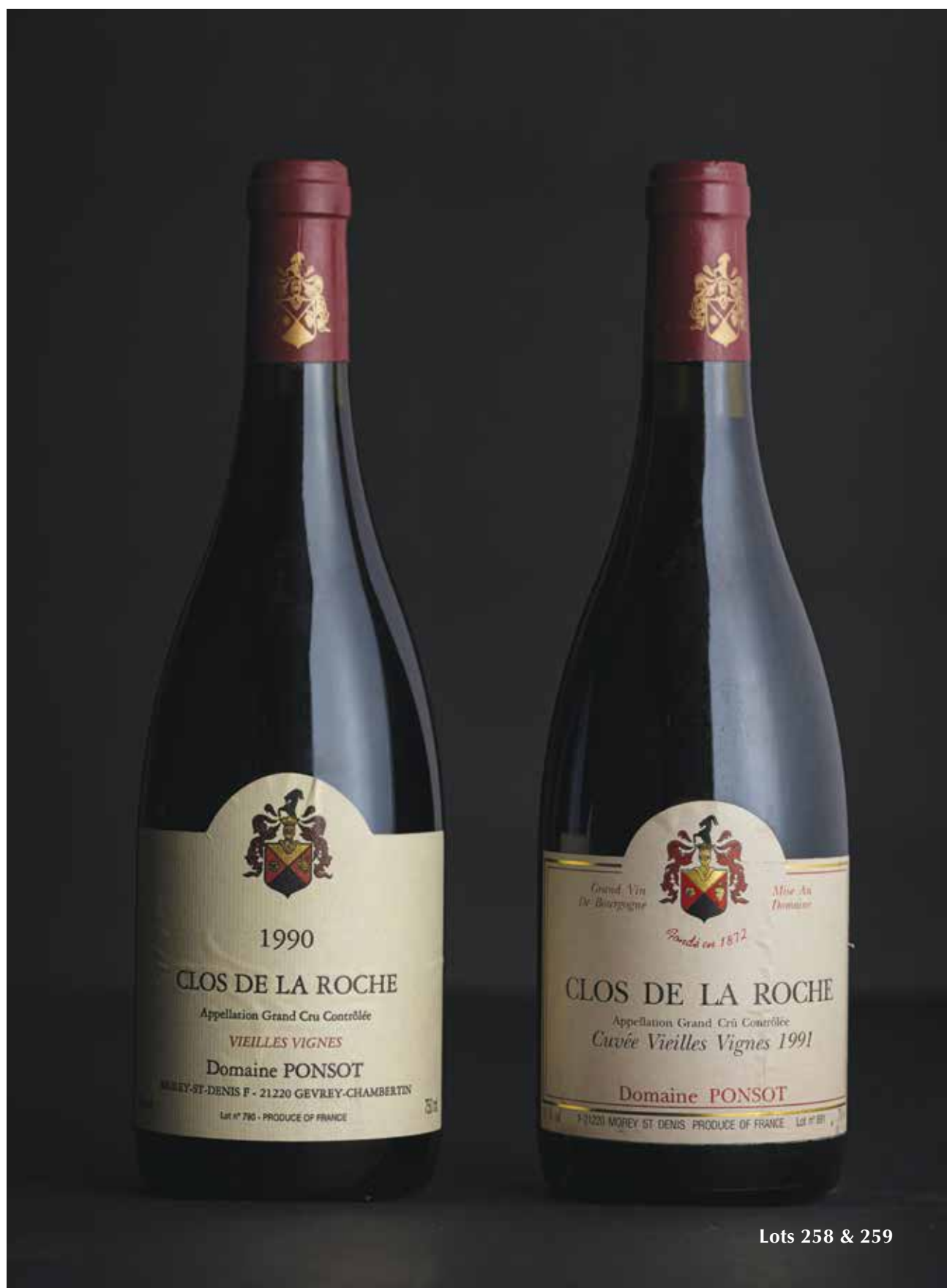
Lots 258 & 259