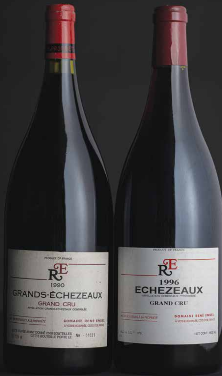
Lots 180 & 184