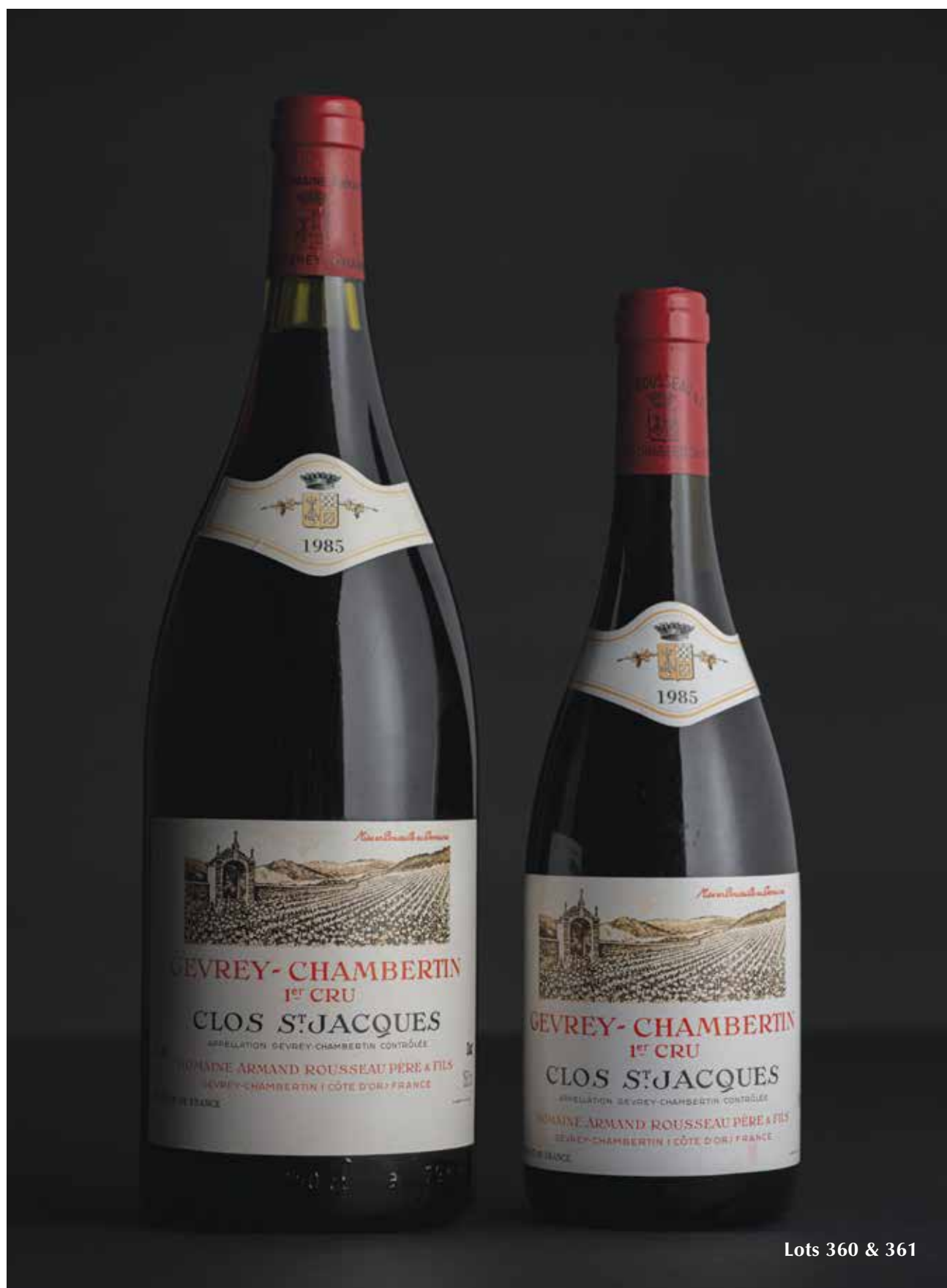
Lots 360 & 361