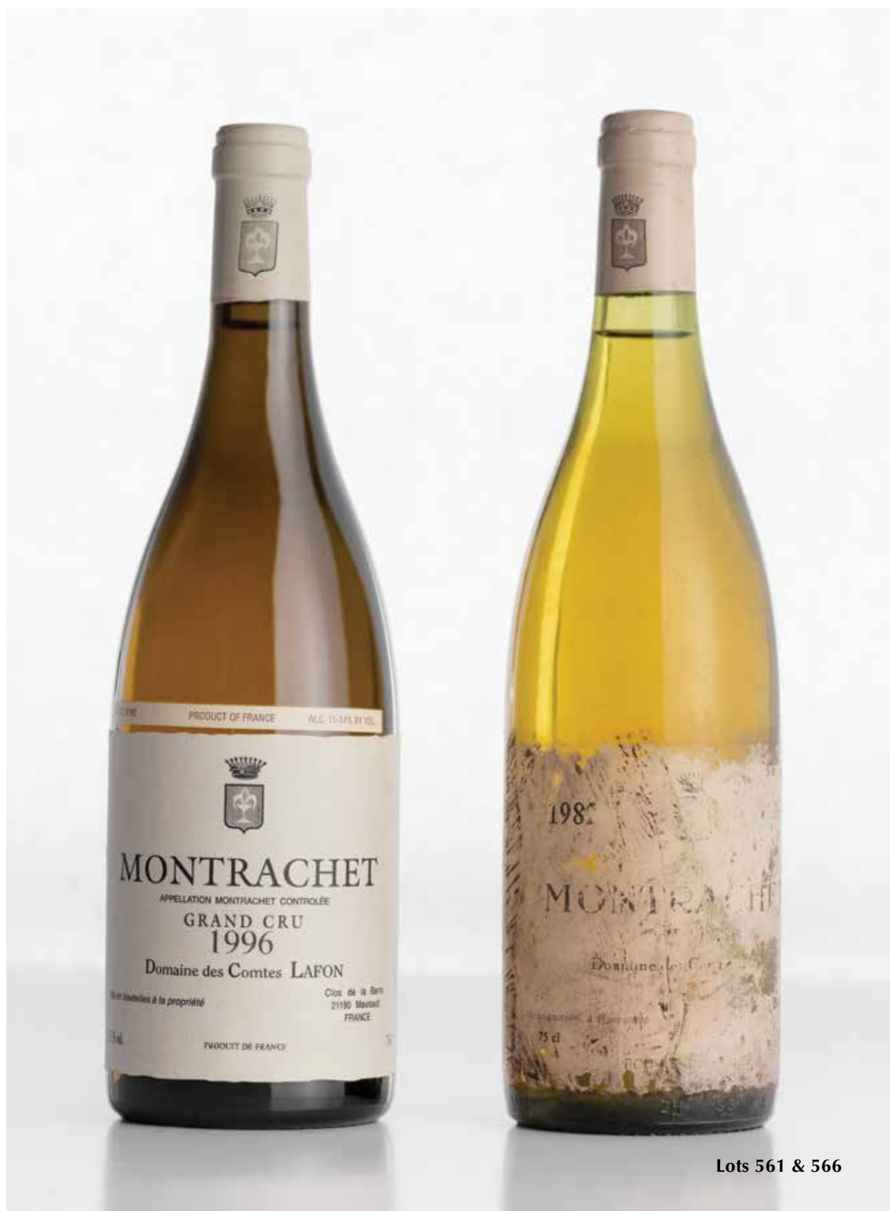
Lots 561 & 566