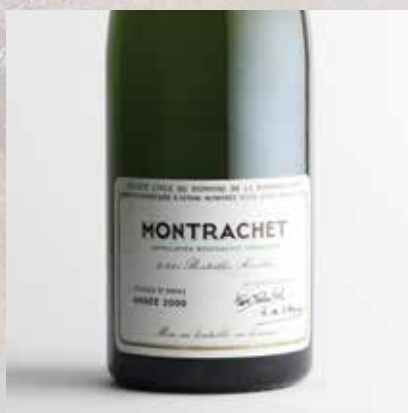
A Jeroboam of 2000 Montrachet by Domaine de la Romanée-Conti nearly doubled the previous world record, realizing just north of $37,000.