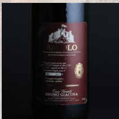
A magnum of 1990 Bruno Giacosa's Barolo Riserva Falletto di Serralunga d'Alba trounced the previous global auction record with an extra $2,000, realizing $5,681.