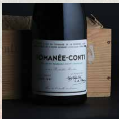
A magnum of 1991 Romanée-Conti sold for $51,870, besting the previous world record by over $10,000.