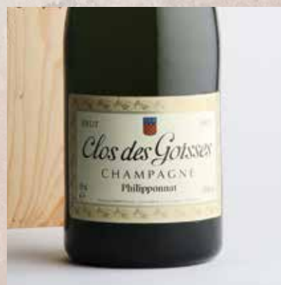
A magnum of Philipponnat Clos des Goisses from the 1953 vintage topped the previous world record and realized $4,940.